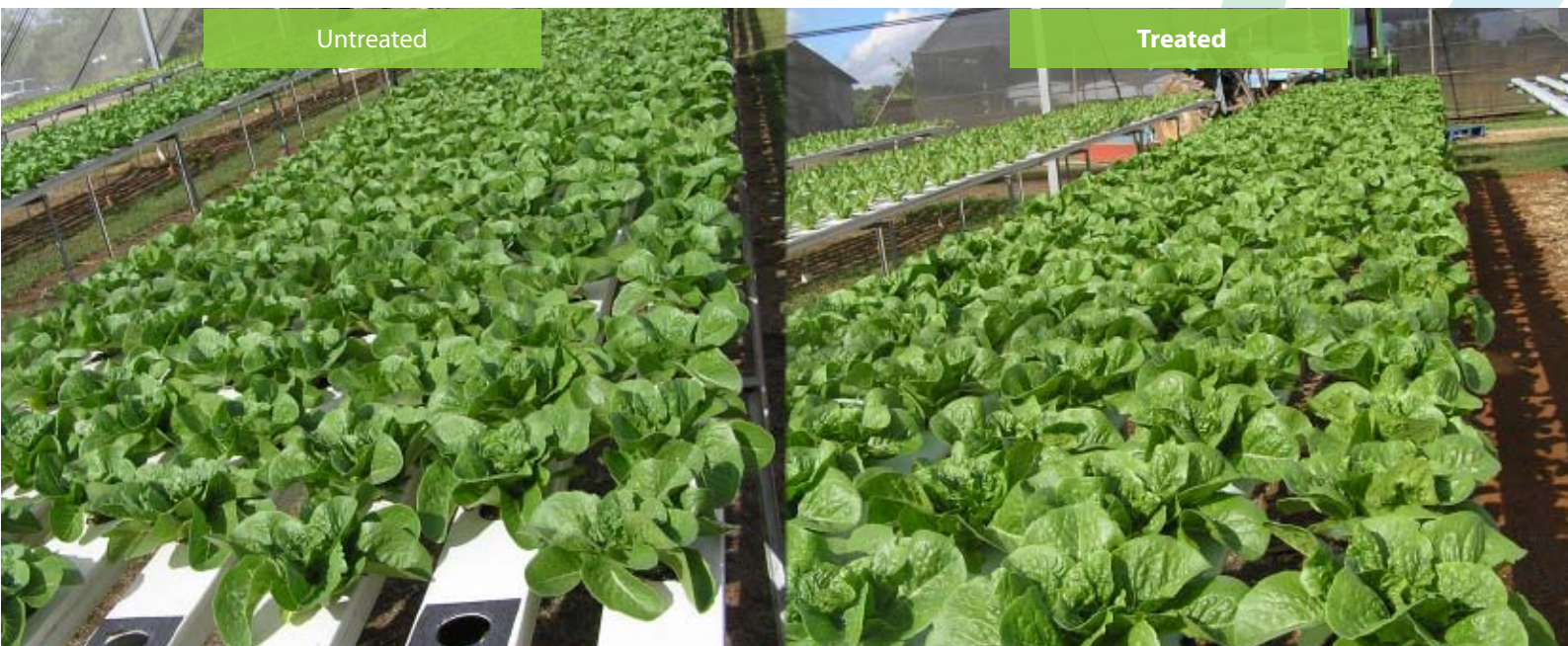
Lettuce. Both tables planted at the same time. Note the more robust growth on the treated table.